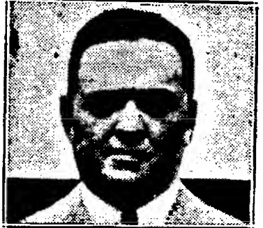
J. EDGAR HOOVER Target of Accusations

That's what happened to the Lindberghs... Did any of us ever imagine Lindbergh and Anne would be hissed in newsreel theaters?... And if G-man Hoover decides to use 150 of his agents to trap the fiend—and if he uses tear gas bombs and machine guns—there will be some fools who will come out in their editorials and columns and accuse the G-men of "showing